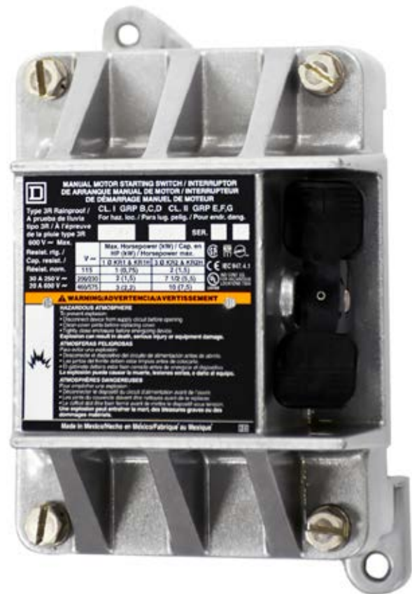
Model EDS Power Disconnect